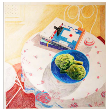
Artichokes, Prismacolor on paper, 36 x 35 inches, 2001