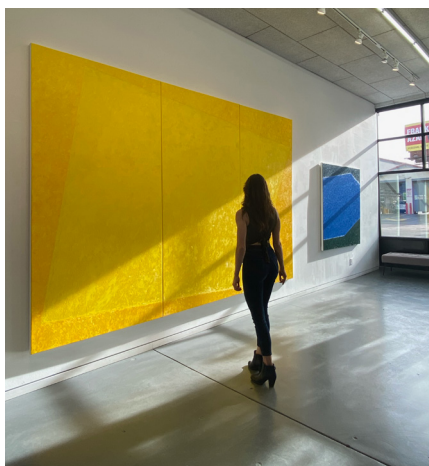
Immersion 1284 (Sun) Oil on canvas (triptych) 96 x 144 inches 2022