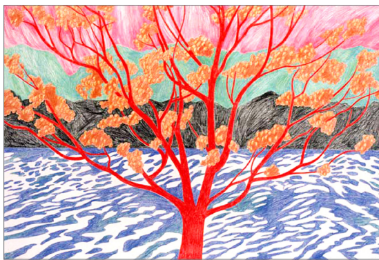
Chinaberry Tree and Lake Prismacolor on paper 50 x 72 inches 1988

My work represented by galleries in Austin, Dallas, Houston, Taos, and Atlanta.